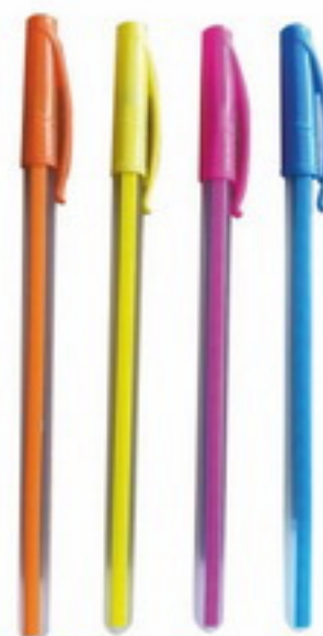
SINGLE-TIME USE PENS (Use and throw)