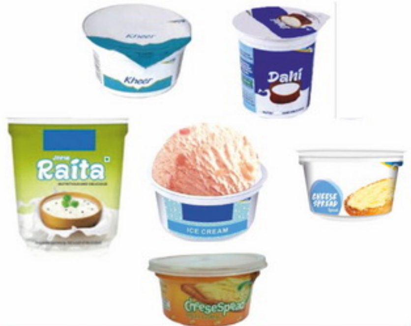
SINGLE USE PLASTIC CONTAINERS (used for Curd, Kheer, Ice Creams etc.) Less than 250 microns used for packaging of dairy items