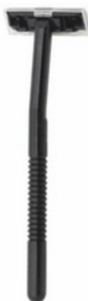
SINGLE-TIME USE RAZORS (Use and throw)