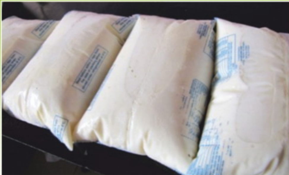
Virgin Plastic bags used for milk having thickness not less than 50 micron