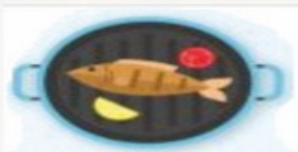
Enters our food chain