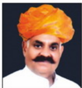
Shri. V.P. Singh Badnore Administrator of U.T. Chandigarh

“City Beautiful should say 'NO' to Plastic.”