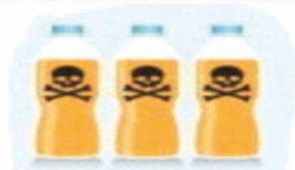
Leaches toxins into food & drink