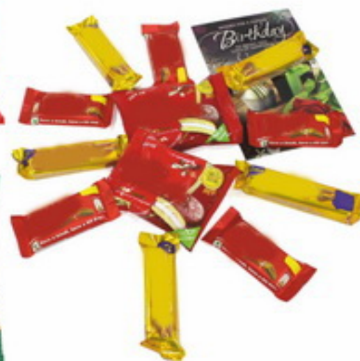
MULTILAYERED PACKAGING Used for Food / Snacks Packing