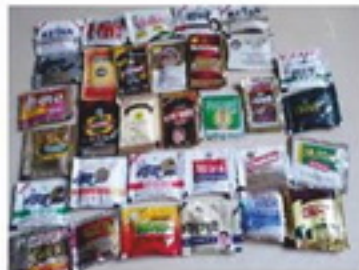
PLASTIC SACHETS With packaging capacity of 50 ml/50 gm. and less