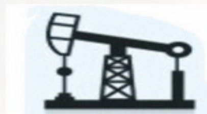
Made from fossil fuels