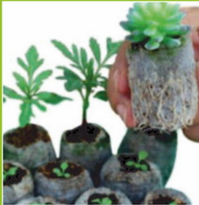
Compostable Carry Bags