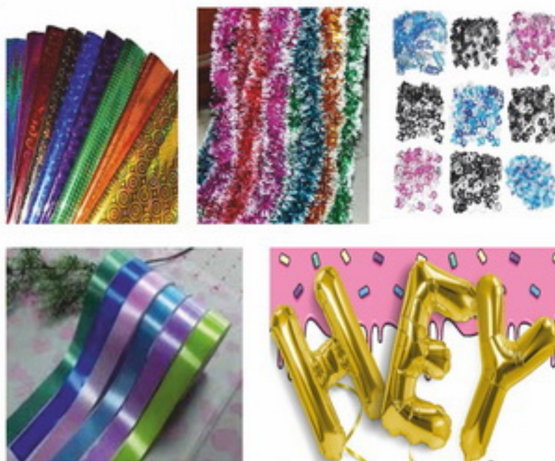
USE OF PLASTIC MATERIAL FOR DECORATION PURPOSE (such as wrapping/packing sheets, frills, garland, confetti, party bloopers, plastic ribbons etc.)