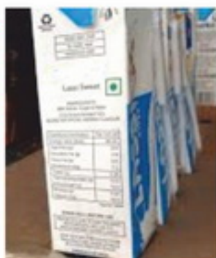
STRAWS Attached with Tetra Packs