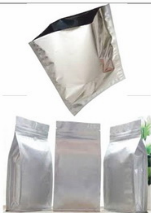
PLASTIC BAG/POUCH FOR PACKING FOOD ITEMS (sold in the name of Silver/Aluminium)