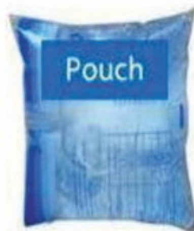
DRINKING WATER SEALED GLASSES AND PLASTIC MINERALWATER POUCH