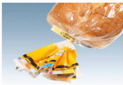
INDUSTRIAL PACKAGING (of any kind) less than 50 microns