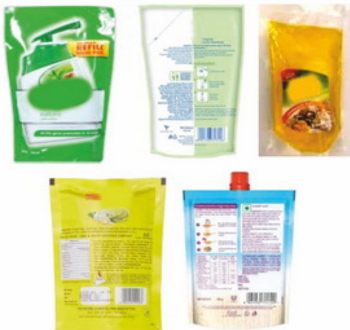
PLASTIC REFILL POUCH having quantity less than 500 ml.