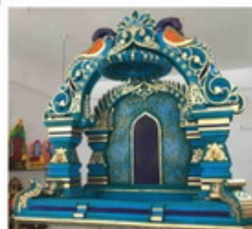
USE OF THERMOCOL FOR DECORATION PURPOSE