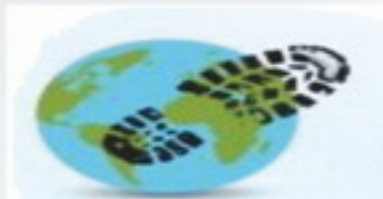
Huge carbon footprints