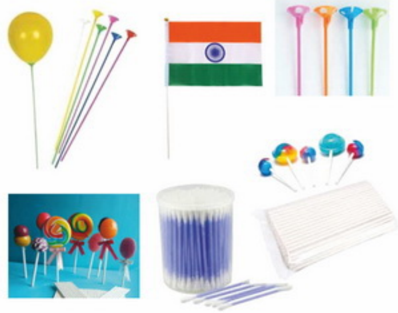
PLASTIC STICKS for Ear Buds, Balloons, Flags and Candies