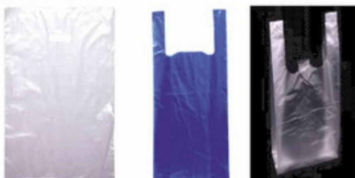
POLYTHENE/PLASTIC CARRY BAGS WITH OR WITHOUT HANDLE IRRESPECTIVE OF SIZE, SHAPE AND COLOUR (excluding bags permissible under Bio-Medical Waste Management Rules, 2016)