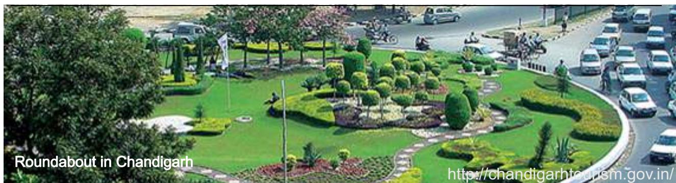
Roundabout in Chandigarh