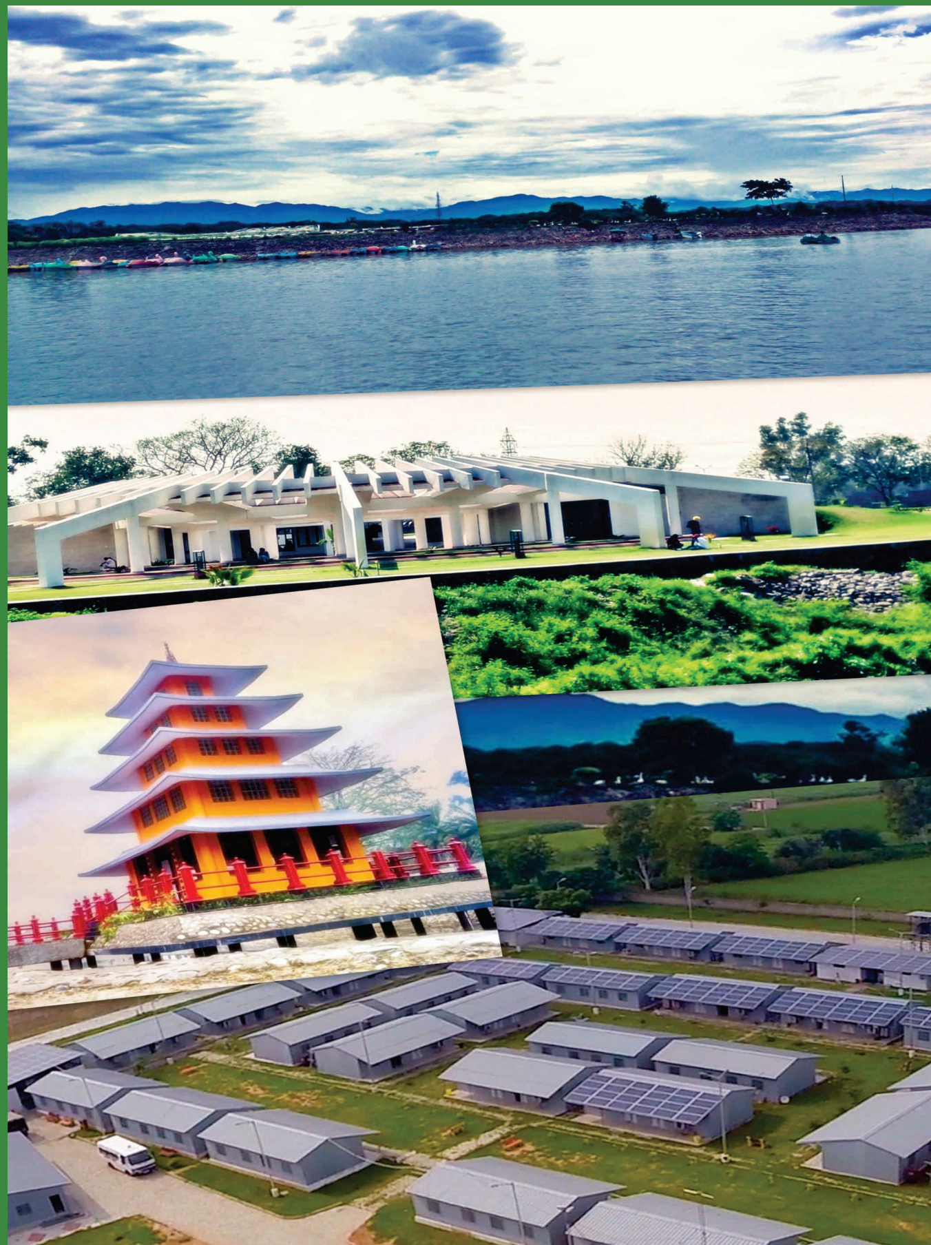
STATE OF ENVIRONMENT CHANDIGARH - 2014